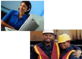
Top 30 U.S. States & Territories, by Total Workers Certified

"INNOVATION DISTINGUISHES BETWEEN A LEADER AND A FOLLOWER" - STEVE JOBS